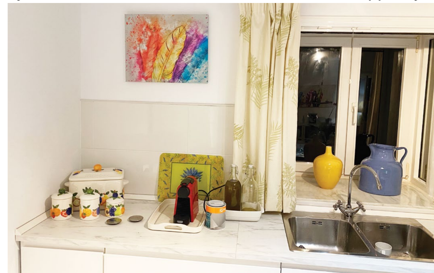
Accessorising your kitchen with charity shop finds is one way to cut costs.

Instead, they were forced to rent an apartment whilst the rat catchers did their work and a massive clean up operation began.