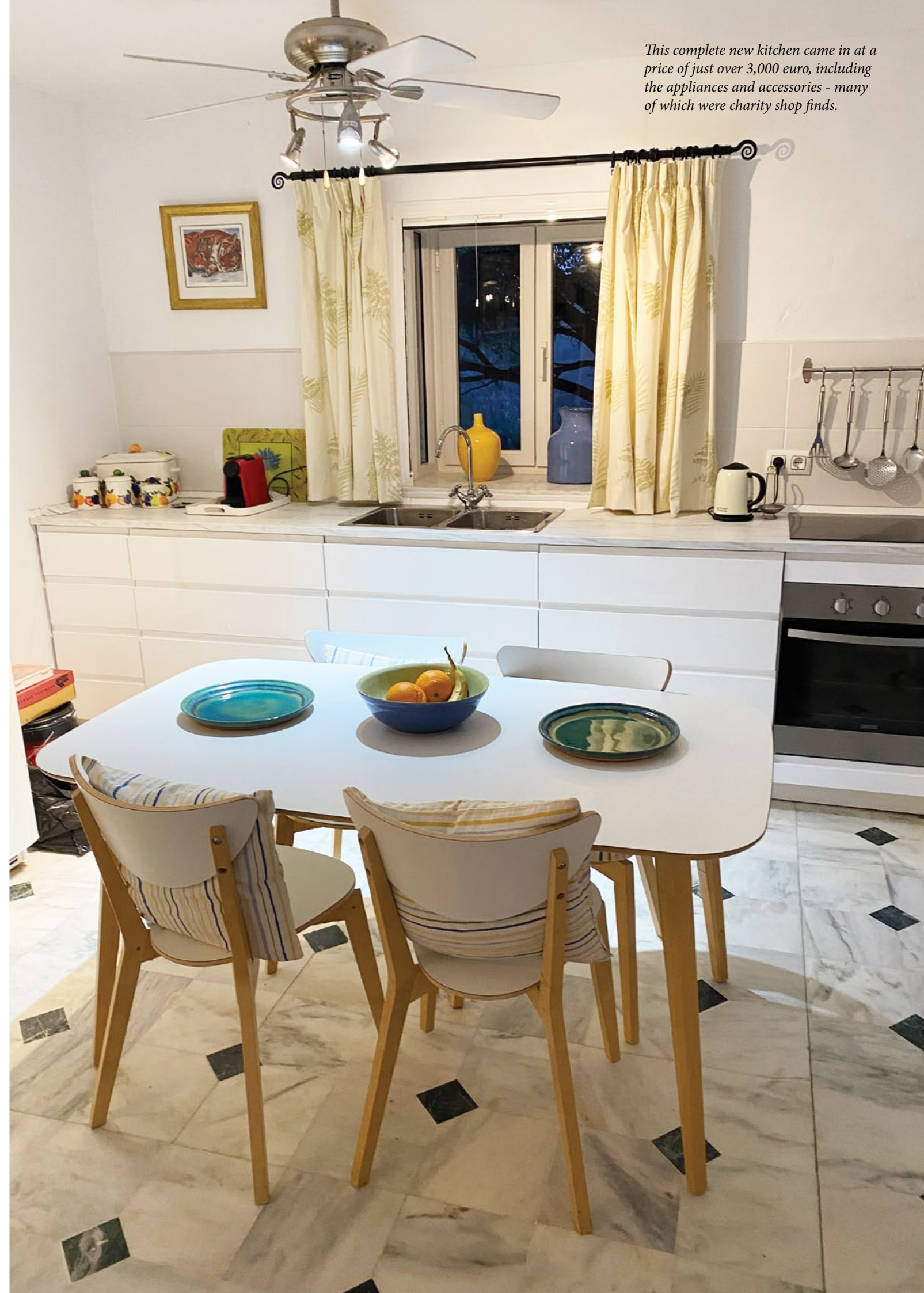
This complete new kitchen came in at a price of just over 3,000 euro, including the appliances and accessories - many of which were charity shop finds.

VISIT US AT WWW.KITCHEN-MAKER.CO.UK - ONLINE MAGAZINE