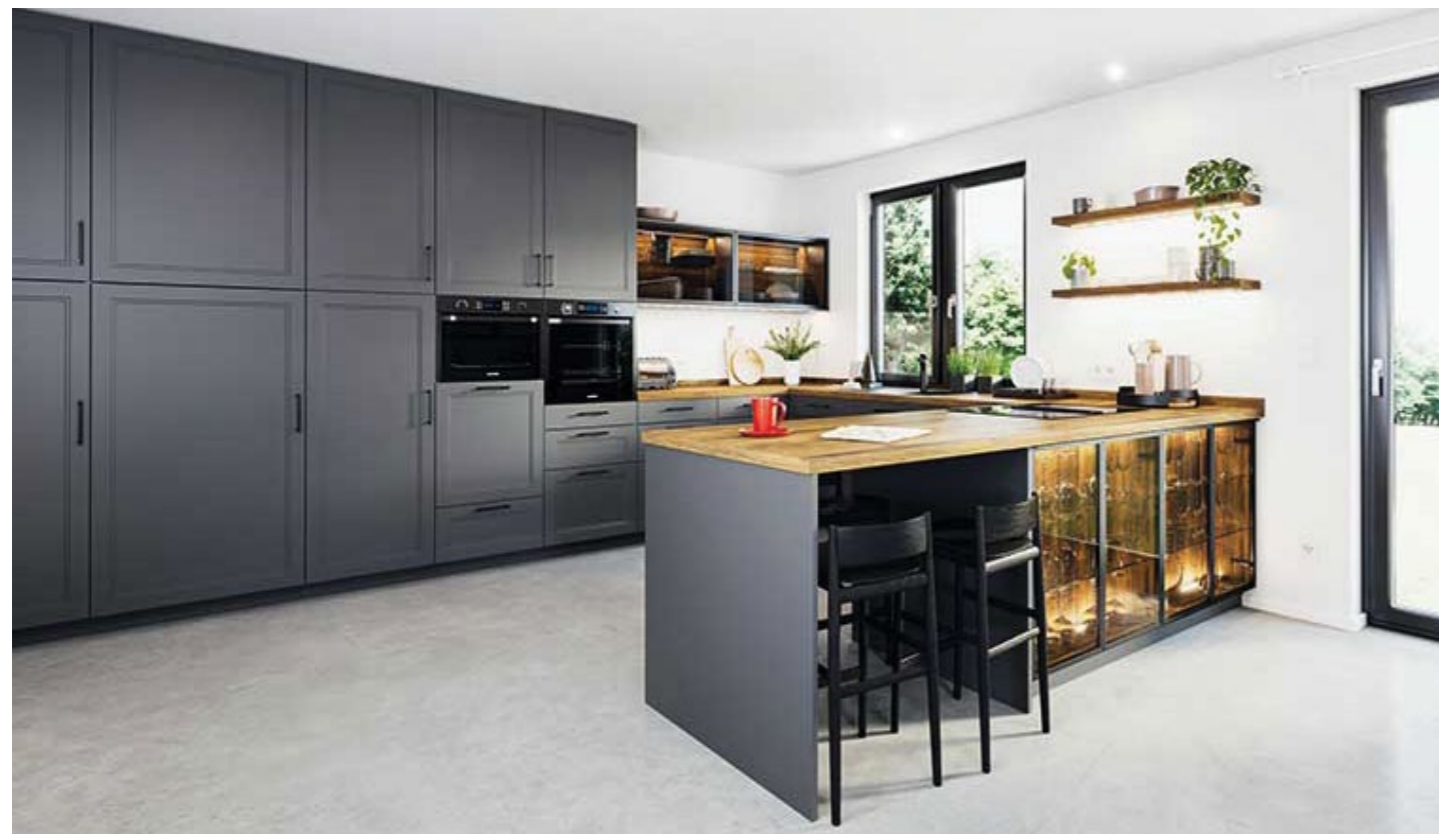
Ostermann provides furniture makers with a wide selection of plain-coloured edgings with a matt surface finish.

VISIT US AT WWW.KITCHEN-MAKER.CO.UK - ONLINE MAGAZINE