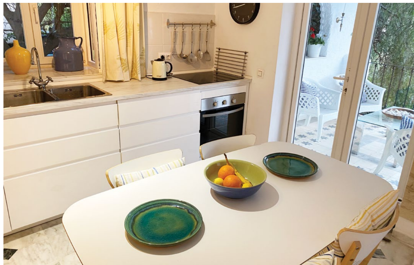
The almost brand new IKEA kitchen table and chairs in the foreground was picked up for a bargain price at a local second hand furniture store located close to the author's holiday apartment in southern Spain.

It was a case of "first come, first served" and the very same day that the Spanish father and son, who had been first to make contact, arrived in two separate vehicles (both with open topped trailers) and within three or four hours the old kitchen was no