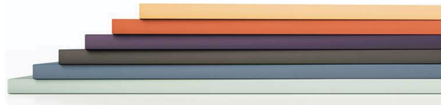
In stock at Ostermann: edgings to match the new surfaces of the Bloom Collection by Arpa Fenix NTM.