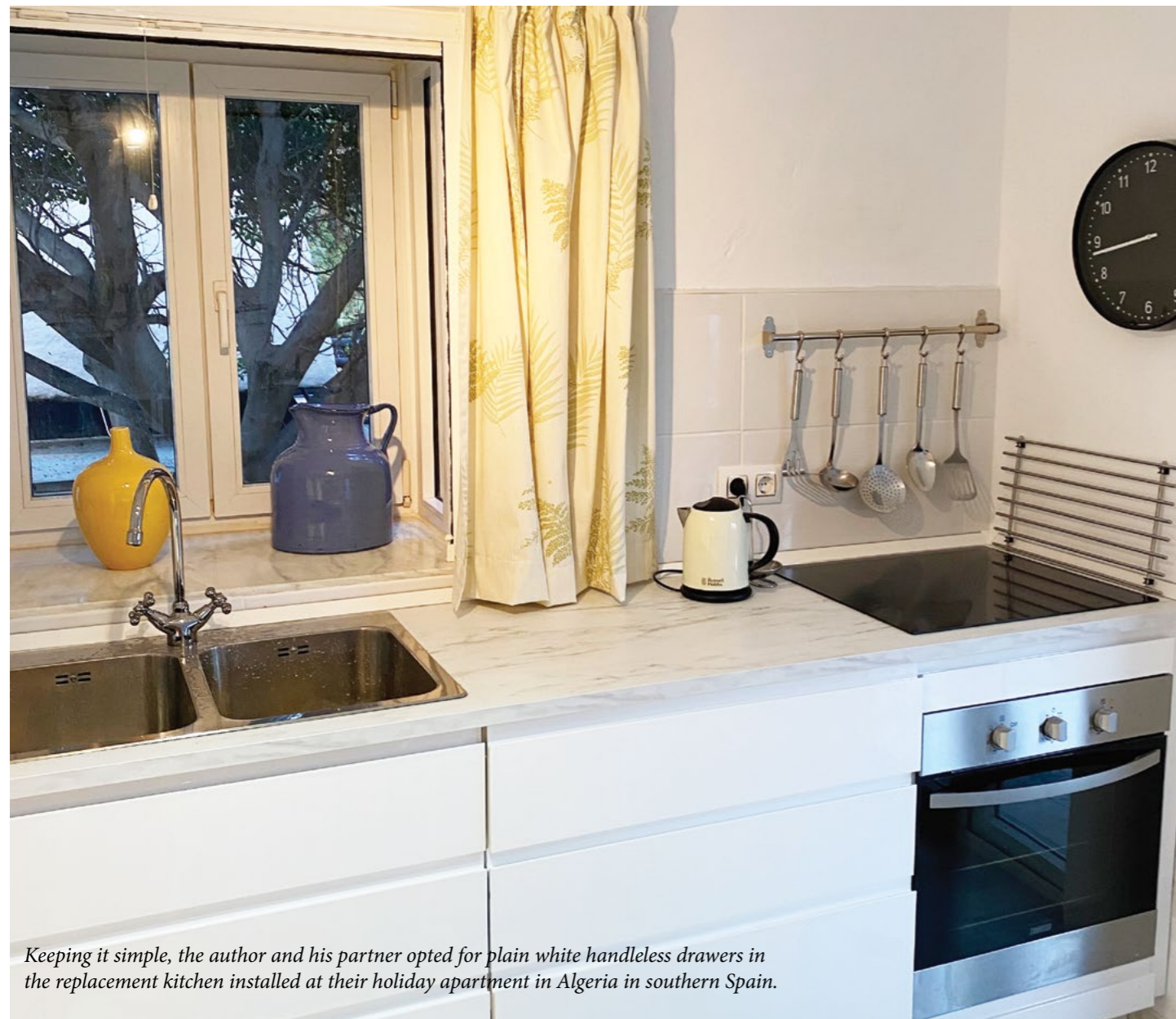
Keeping it simple, the author and his partner opted for plain white handleless drawers in the replacement kitchen installed at their holiday apartment in Algeria in southern Spain.

VISIT US AT WWW.KITCHEN-MAKER.CO.UK - ONLINE MAGAZINE