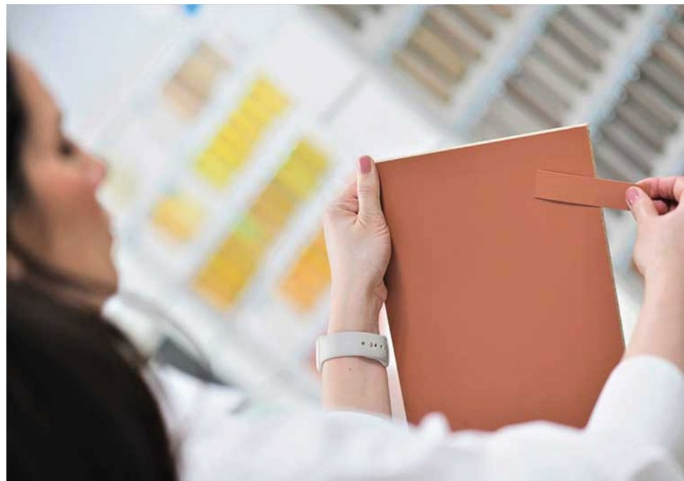
Under the Raukantex brand Rehaus meets every possible market demand.

Want to find out more? Visit www.rehaus.uk/edge-band-search or www.rehaus.com/collection