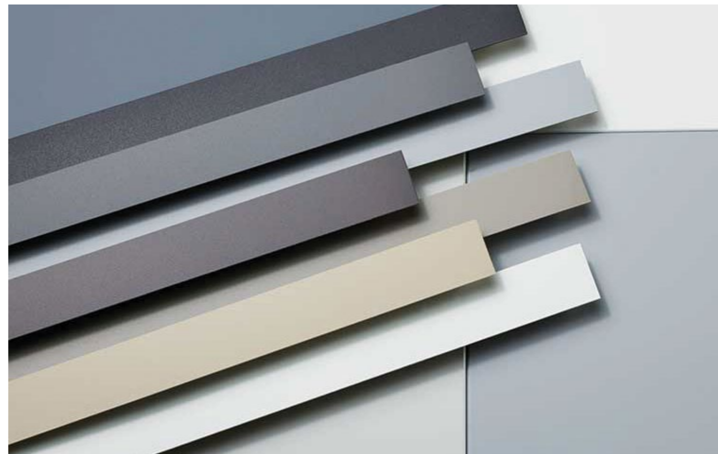
Ostermann delivers a great diversity of furniture edgings with cutting-edge matt finishes directly from stock. In this picture you see a selection of extremely matt trend edgings in grey shades.