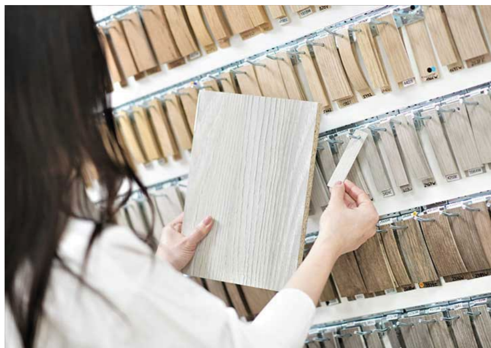
Rehaus is now able to offer a much wider range of options for the kitchen furniture industry than ever before.

VISIT US AT WWW.KITCHEN-MAKER.CO.UK - ONLINE MAGAZINE