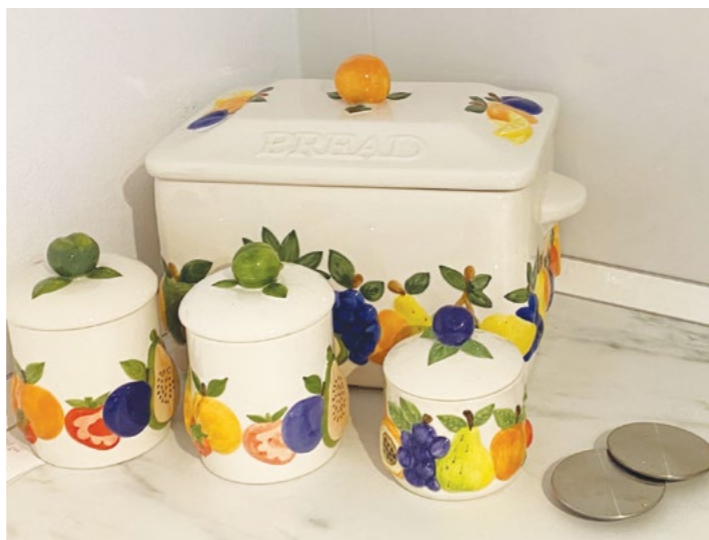
A visit to a local cancer care charity shop in Mojacar in southern Spain resulted in the purchase of this brightly coloured bread bin and matching cannisters for just 18 euro.

A copper cap, 30 euro and 20 minutes later and at least that job was done. However as luck would have it, the conversation with the Welsh plumber and his foster son, who was visiting on holiday revealed the fact that they were willing to take on the work (despite the lack of square walls) and to do so at a price which seemed like