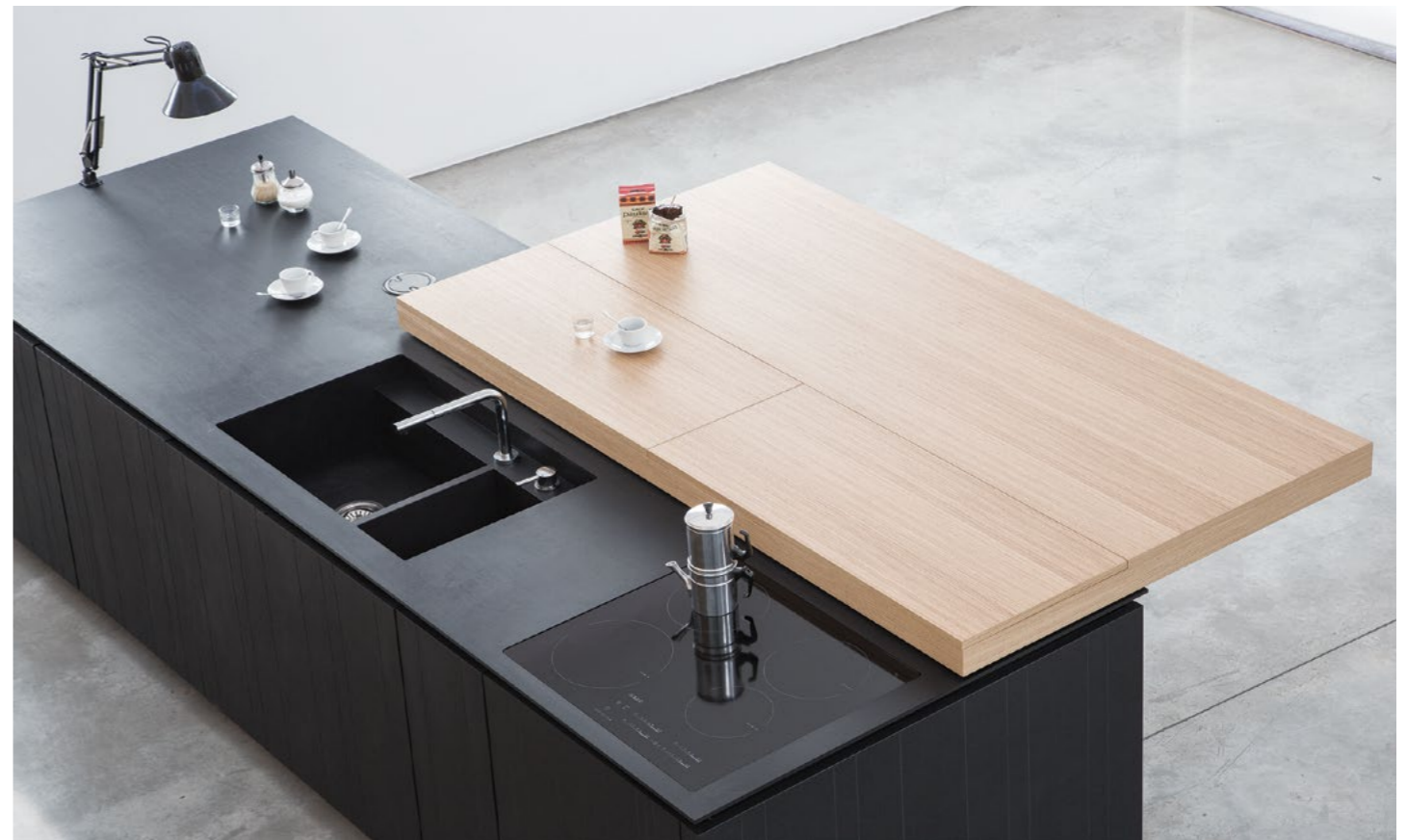
VISIT US AT WWW.KITCHEN-MAKER.CO.UK - ONLINE MAGAZINE