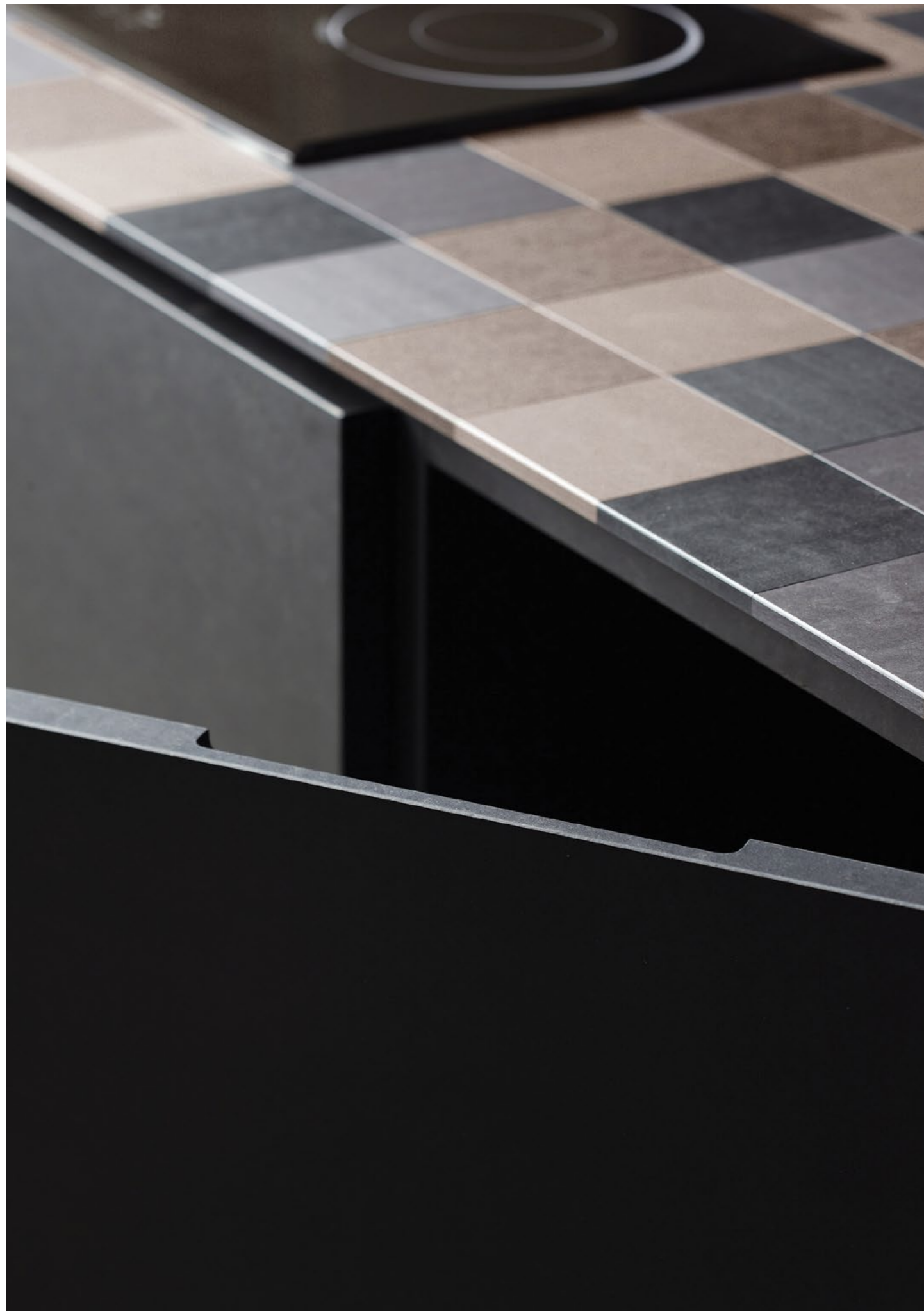
VISIT US AT WWW.KITCHEN-MAKER.CO.UK - ONLINE MAGAZINE