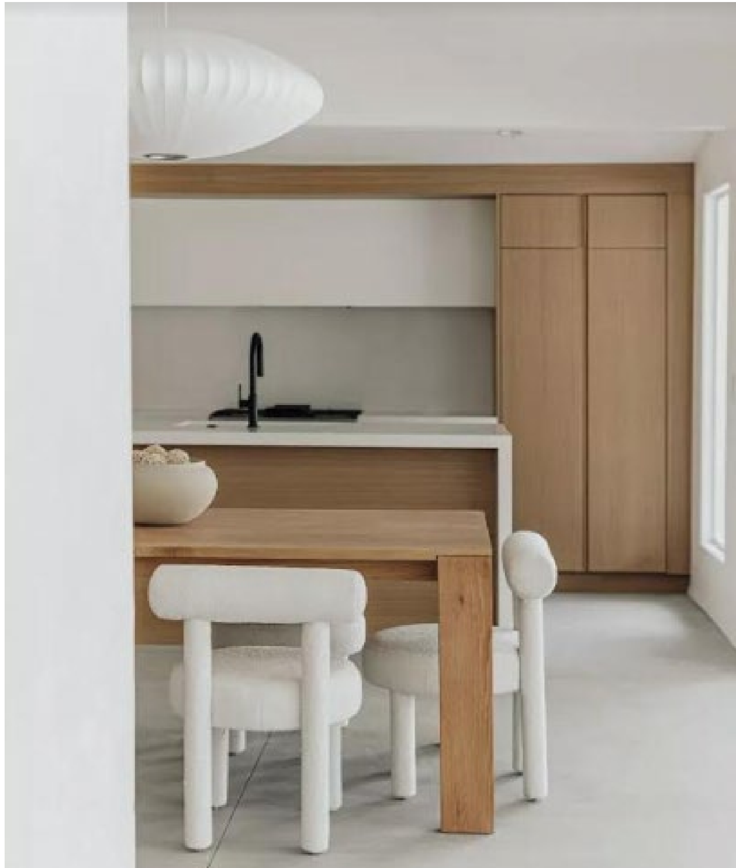
VISIT US AT WWW.KITCHEN-MAKER.CO.UK - ONLINE MAGAZINE

For the most pared-back look possible, white slab cabinets are the obvious choice. Traditional styles with recessed panels, such as shaker cabinets, should be avoided. If you still want the visual appeal of a Shaker but with a more modern reinvention, try slim Shaker style cabinets for a more minimalistic take.