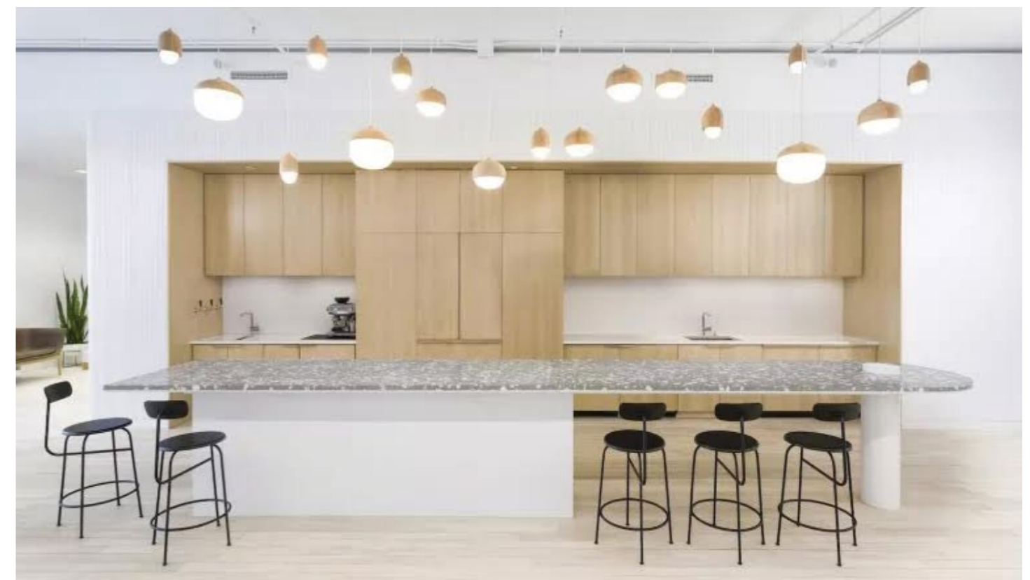
VISIT US AT WWW.KITCHEN-MAKER.CO.UK - ONLINE MAGAZINE