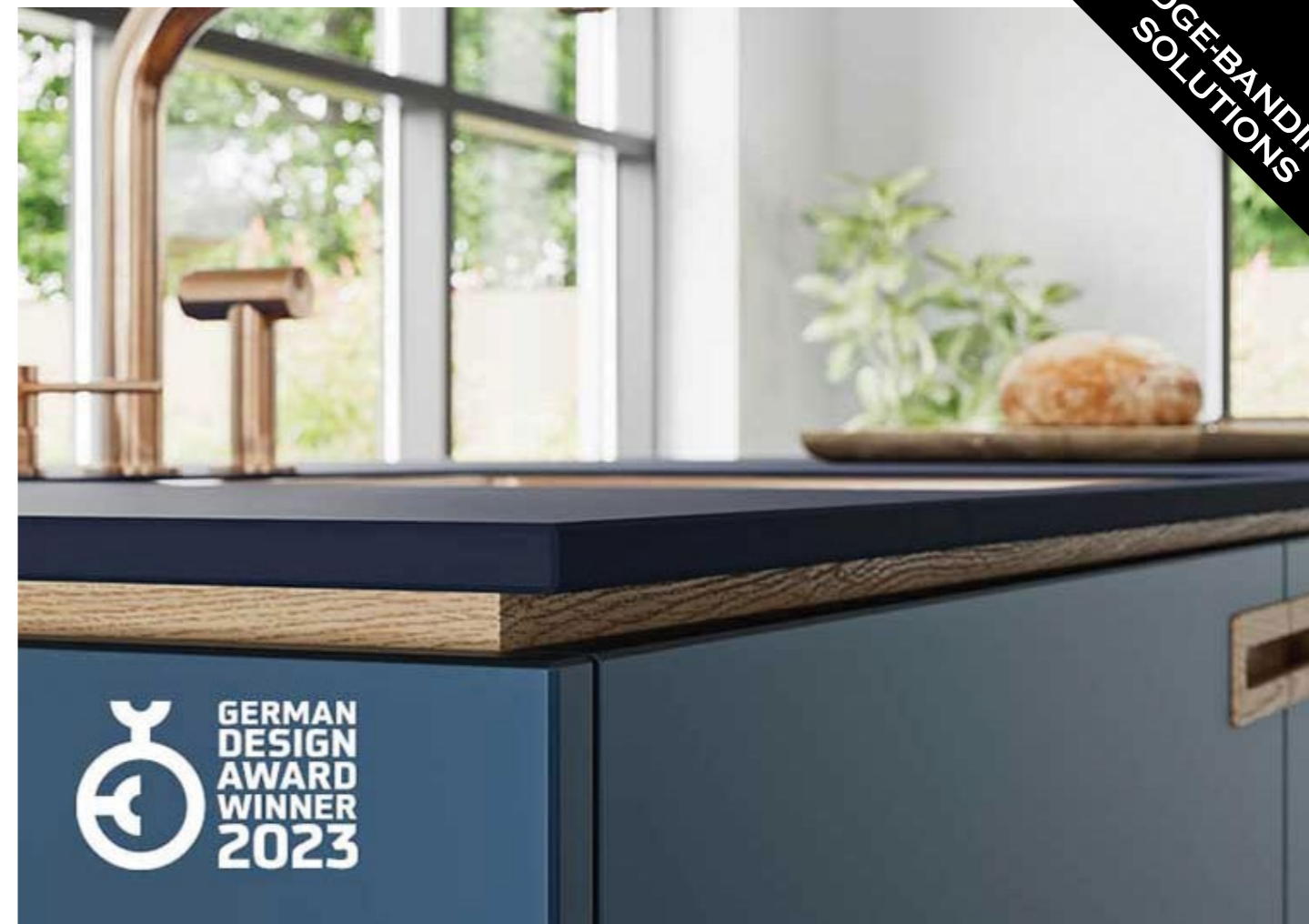
Above : Rauvisio crystal Deep Collection's exciting plain colours. Below: Rauvolet storage solution Deep version of crystal-line.

VISIT US AT WWW.KITCHEN-MAKER.CO.UK - ONLINE MAGAZINE