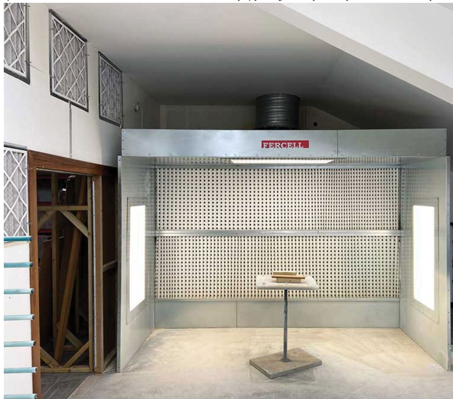
VISIT US AT WWW.KITCHEN-MAKER.CO.UK - ONLINE MAGAZINE

Want to find out more? Visit www.fercell.com