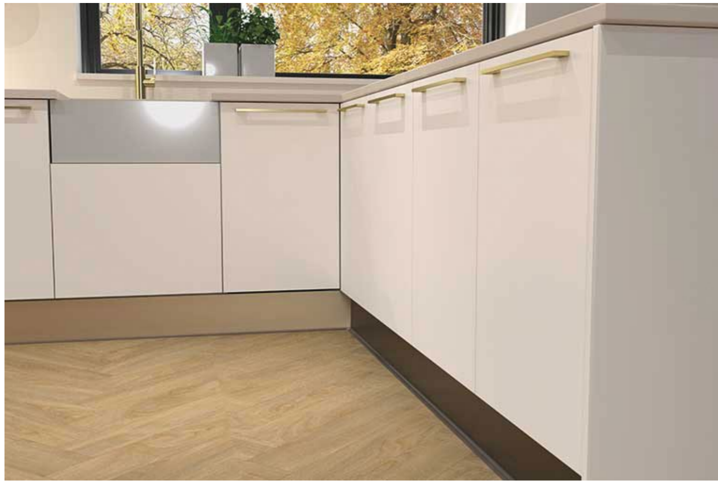
Above: Shell White and Gold, and below: Pearl Gold and Serica Cobalt Blue