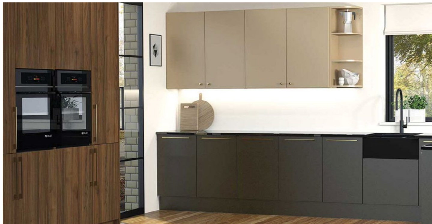
Fineflex metallic kitchen.

VISIT US AT WWW.KITCHEN-MAKER.CO.UK - ONLINE MAGAZINE