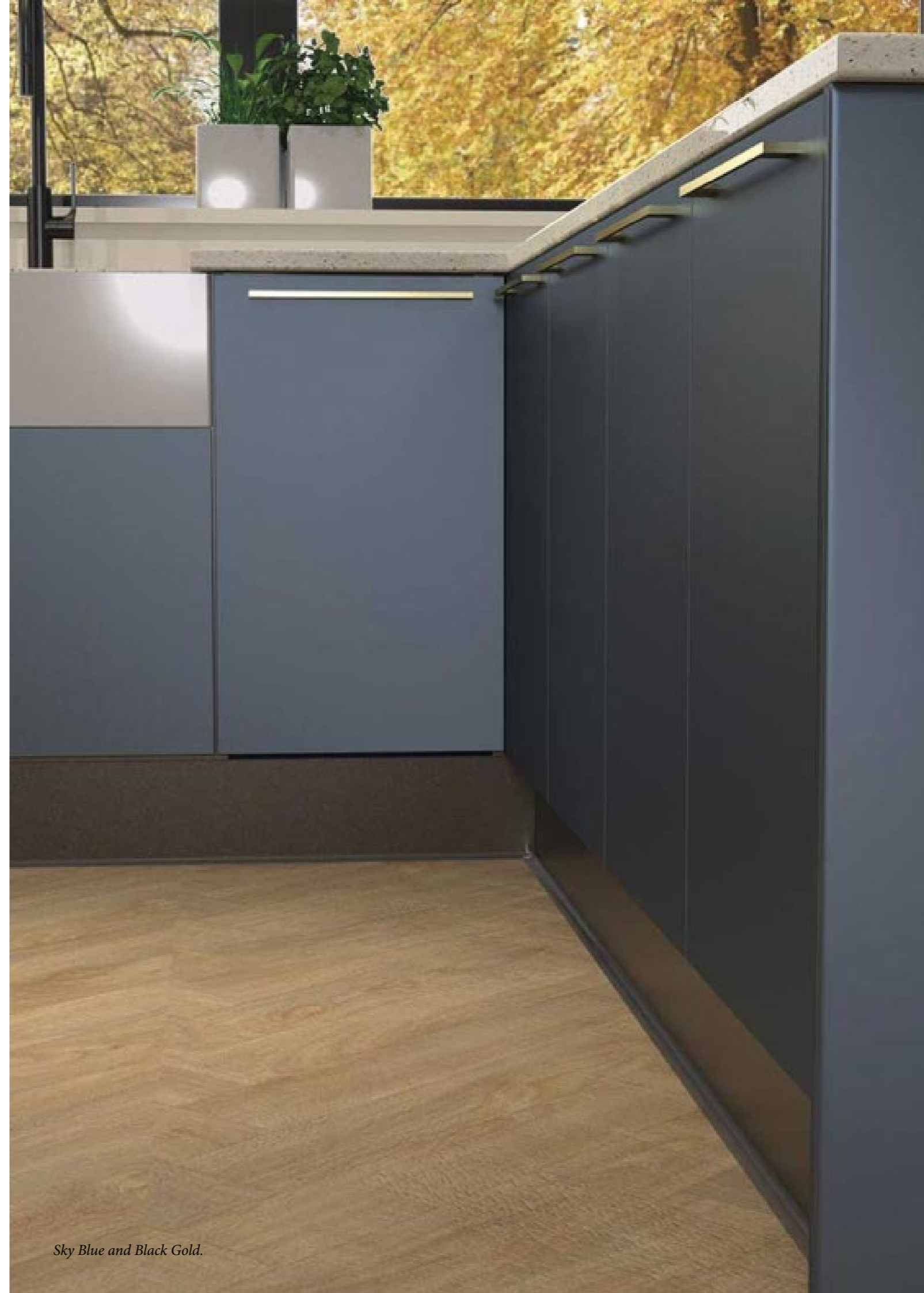
Sky Blue and Black Gold.

VISIT US AT WWW.KITCHEN-MAKER.CO.UK - ONLINE MAGAZINE