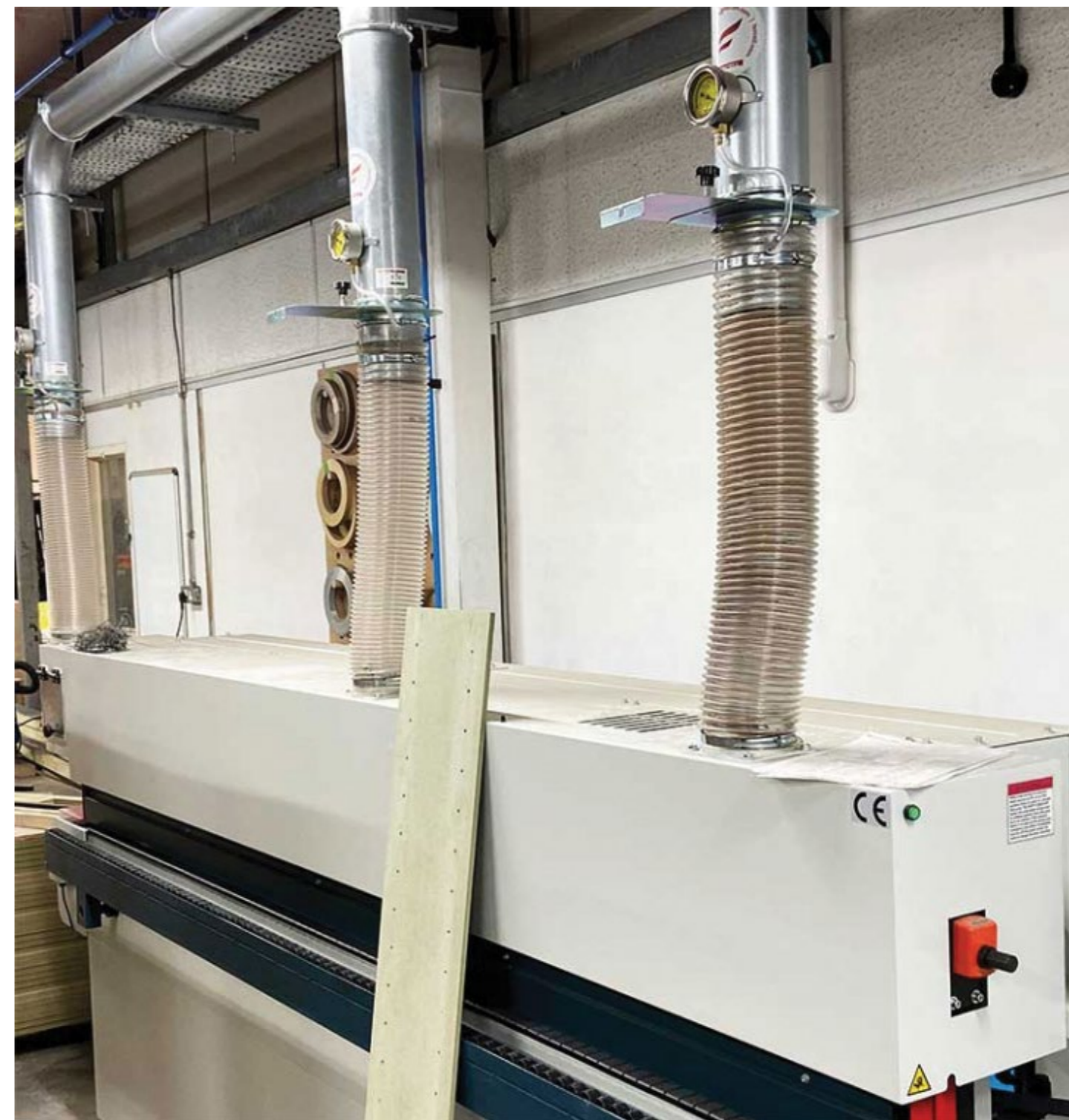
VISIT US AT WWW.KITCHEN-MAKER.CO.UK - ONLINE MAGAZINE