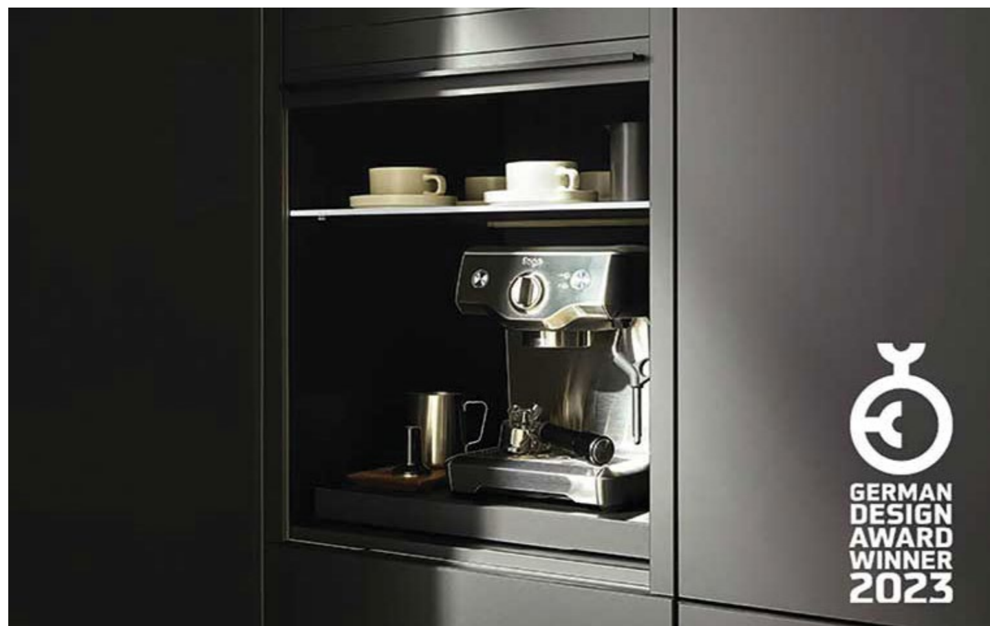
German Design Award for the Rauvisio crystal Deep collection.

Want to find out more? Visit www.rehau.uk