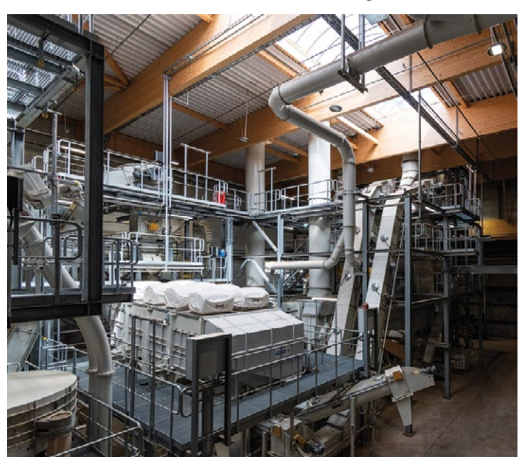
Wood-based material manufacturer, Egger UK Ltd has invested over £15 million into recycling operations at its site at Hexham in Northumberland.

'Red tones are getting a great deal of interest from the UK market, as they offer warmth.