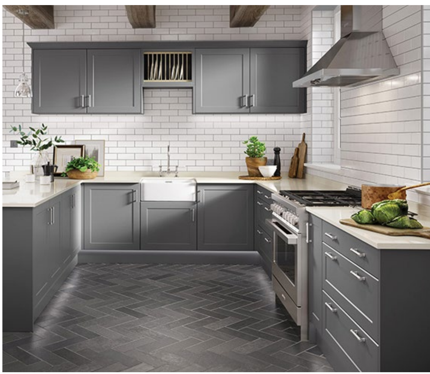
VISIT US AT WWW.KITCHEN-MAKER.CO.UK - ONLINE MAGAZINE

Kitchen manufacturers, retailers and studios will be able to help their customers visualise how the range can be used in their space, with Hafele having added the doors to its "Ideas for Living" website and "Kitchen Planner" - a consumer-facing tool, which enables users to plan their kitchen in 3D and test different design schemes in line with their ideas.