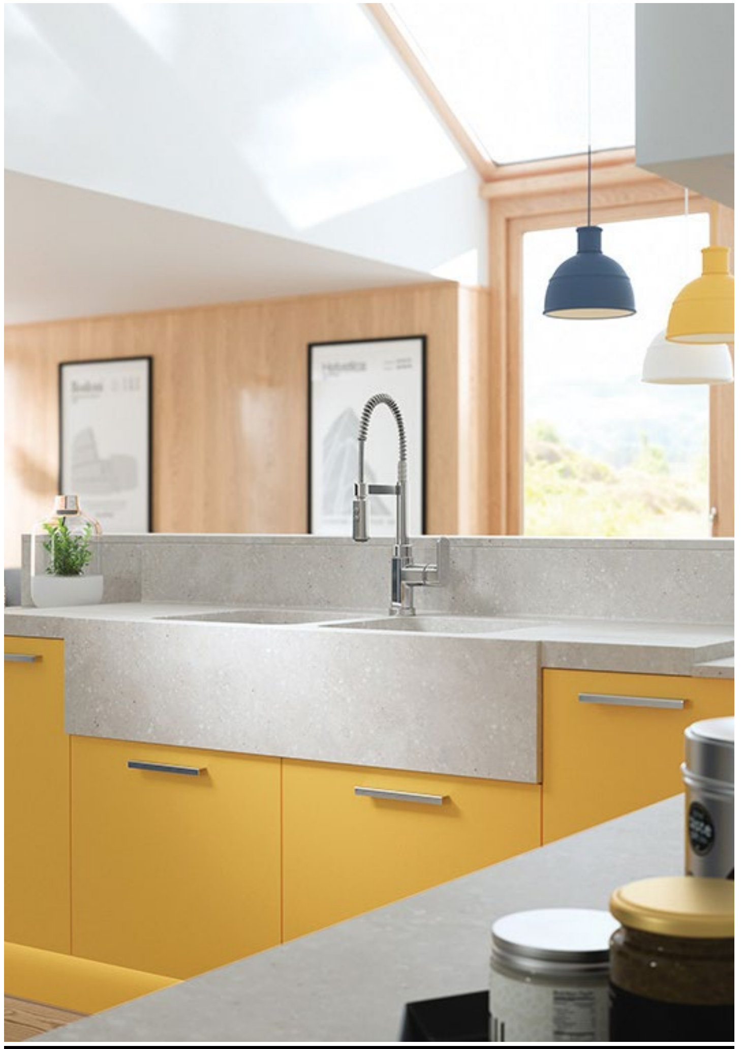
VISIT US AT WWW.KITCHEN-MAKER.CO.UK - ONLINE MAGAZINE