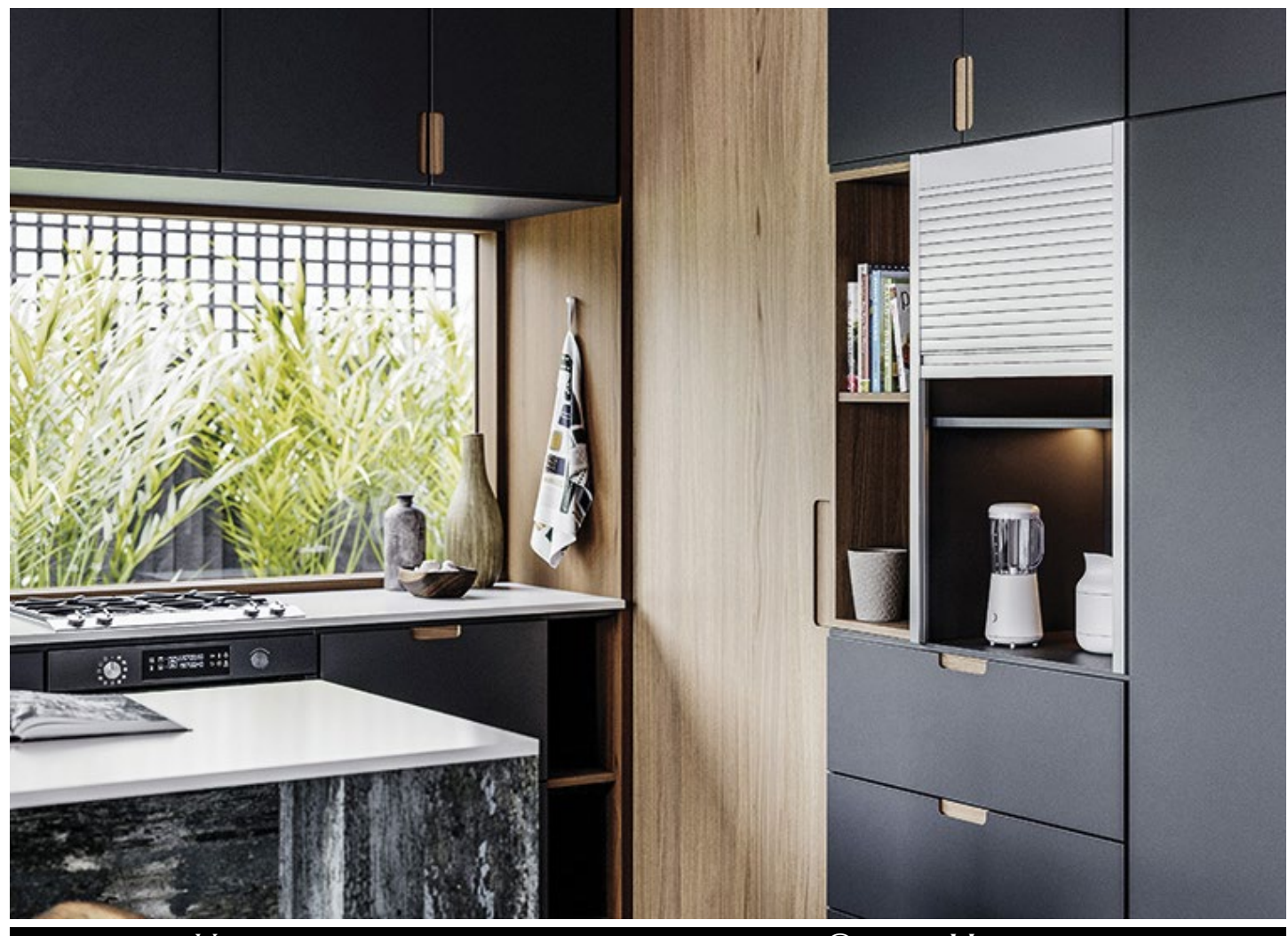
VISIT US AT WWW.KITCHEN-MAKER.CO.UK - ONLINE MAGAZINE

With a choice of either monotonic laminate matte surfaces available in 3050mm x 1300mm x 0.9mm, or pressed panels of